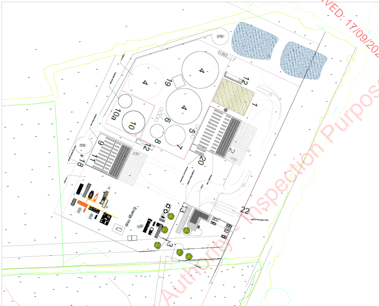
Figure 3.3: Concept Site Layout

Layout selection was an iterative process, with the objective of identifying a suitable layout that;