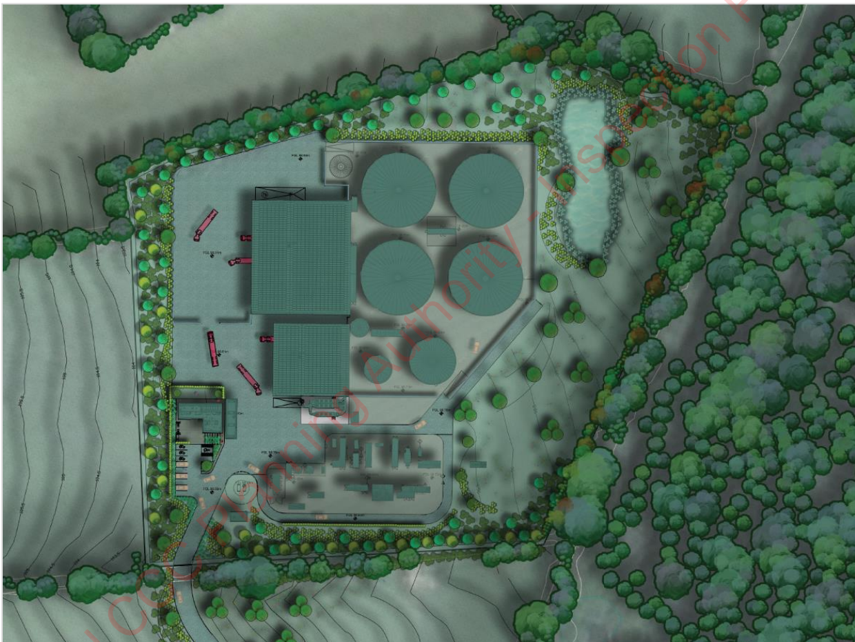
Figure 3.4: Extract from Landscape Plan (Document Ref: 24/NRG/ORS/Rt/M/001)

The landscape plan ( Figure 3.4 ) offers short to long term buffering and is specifically developed to assist in integrating the Proposed Development into its surrounds. In addition, native planting is proposed adjacent to attenuation ponds, in order to provide enhanced biodiversity areas within the Proposed Development. The alternate layout considered initially, which did not include this additional buffering, would have given rise to a higher degree of landscape and visual impact from the Proposed Development, compared to the design and layout ultimately selected.